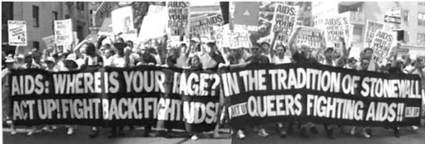
< Stonewall 25<March Up Fifth Avenue

Over the span of its 15-year history, ACT UP (the AIDS Coalition to Unleash Power) has helped to transform the world's consciousness about HIV and AIDS, and made activism a vital part of the LGBT political landscape. Comprehensively documented by media activists and video collectives, the bold strategies, media savvy, and decidedly queer wit of ACT UP remains a fresh source of inspiration to today's artists and activists through the invaluable trove of images sampled in this dynamic program of AIDS activist video. | MIX 2002 |